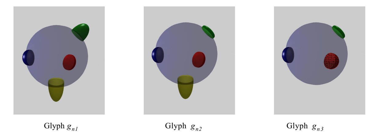
Figure 4. Sequence of environmental item bound glyphs.

The approach of multi-design based comparative analysis provides a framework for two basic (comparative) analysis scenarios. First, comparing several designs of one or several products to one design of either a reference product or an optimized product. Second, comparing several designs among each other. Depending on the goal of the analysis intending to reveal differences among designs of a product family, evaluate the evolution of a product design, gain insight of the quality and quantity of LC related differences of designs, etc. the one of these analysis scenarios most appropriate for the task shall be chosen. In the following we will give an example of visualizing some results of such an analysis using the first (comparative) analysis scenario. The section of the glyph sequence shown in figure 4 is related to three consecutively improved designs being compared to the design of one reference product.