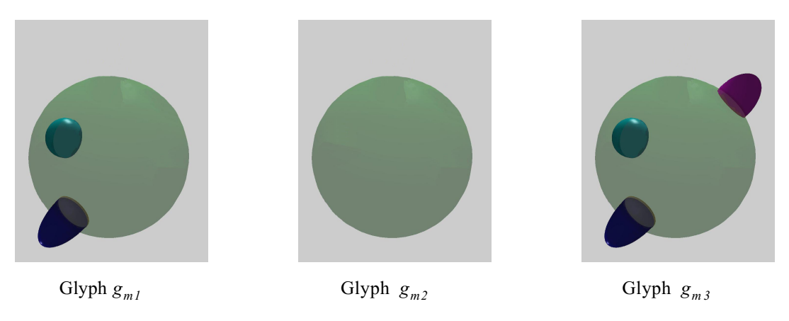
Figure 3. Sequence of life cycle phase bound glyphs.

The analysis of LC related designs using a threshold value based approach basically provides a framework to compare parameter values of the life cycle inventory and other compiled LC related data sources to values, which at a time, are representing critical values related to certain LC phases, activities or processes. Those limit values can either be set internally by individual enterprises and industrial interest groups or being issued by governments in form of recommendations or legal limits for certain products and services. Subject to such a comparative analysis can be all types of information available such as quality, quantity and location of any entity being compared to its corresponding threshold value. In the following we will give an example of visualizing some results of such an analysis. Three different designs of one product where compared to given threshold values.