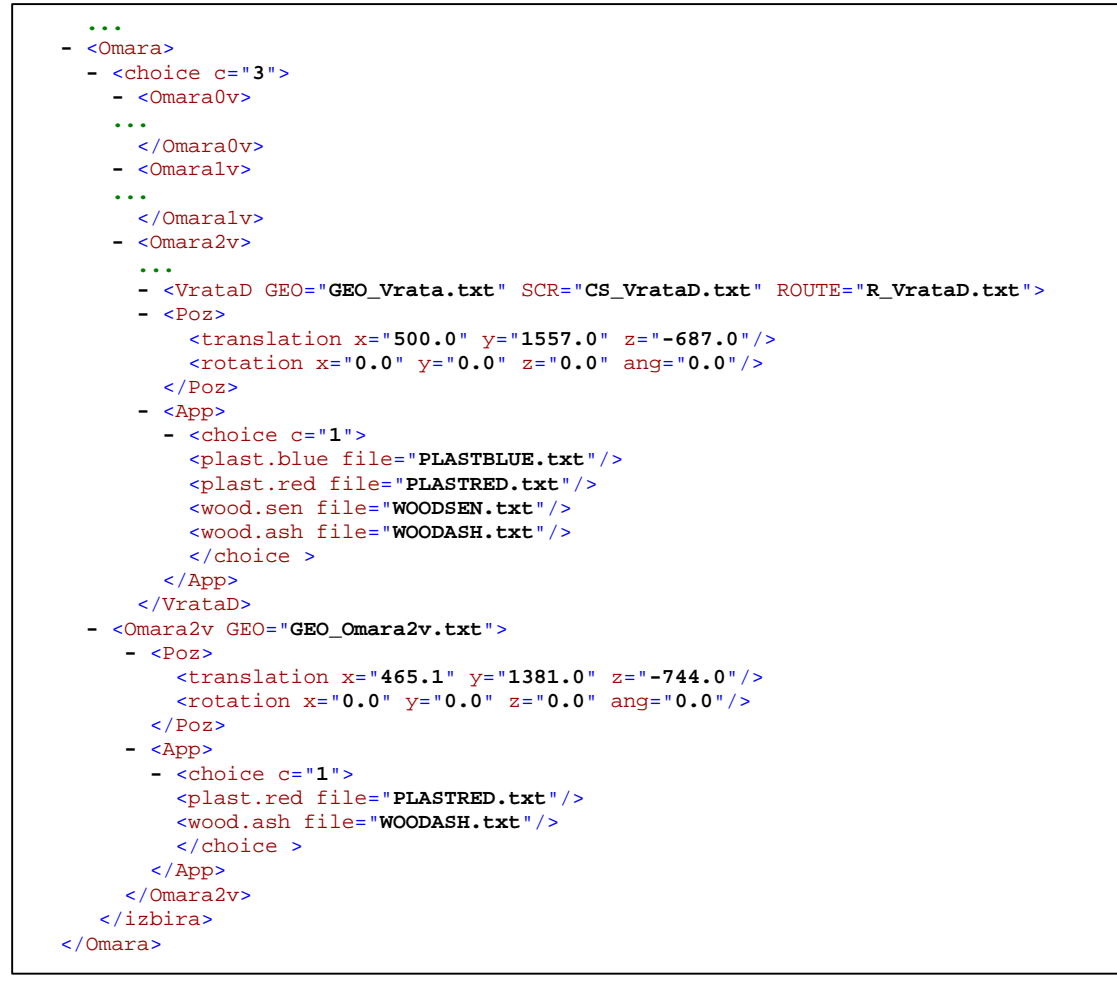
Figure 2. An extract of XML configuration file