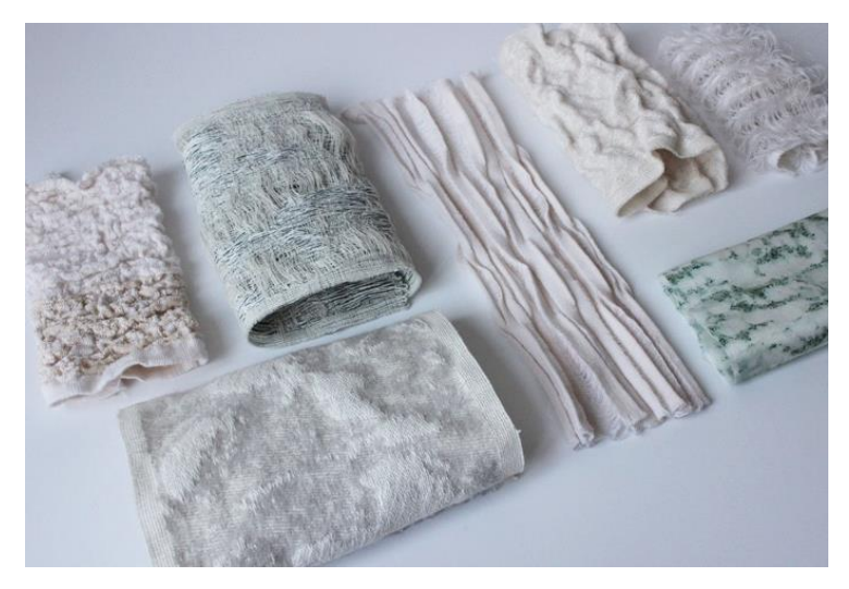
Figure 2. 'The Feeling of the Sea' is an example of a sensuous-driven design process. Left: The three concept boards, material samples and sketches. Right: The series of textiles