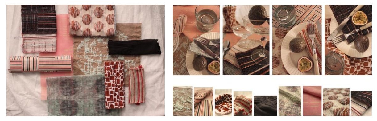
Figure 4. 'The Stripe' is expressed as a series of table textiles. Left: The series of textiles. Right: The series of textiles in an environment (application)

The student includes many different images of stripes on her boards, and she presented the stripe as the central theme of the concept.