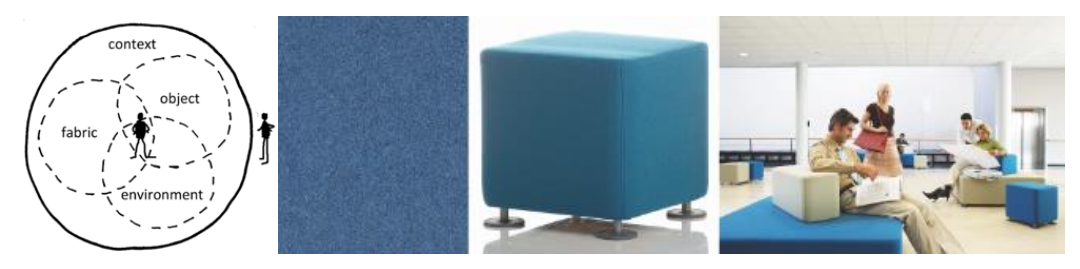
Figure 1. The Tripod Approach [1]

Basically, The Tripod Approach suggests considering the distance to the object as well as the character of the perception. The distance can be divided into three perspectives – material, object and environment – which embrace the multiple levels from fibre to finished product in an overall context. The character of the perception can be either participant or observant [1, 2]. Originally the material category was defined as 'fabric', but we have experienced that 'material' is more precise. Therefore, we use 'material' in this paper.